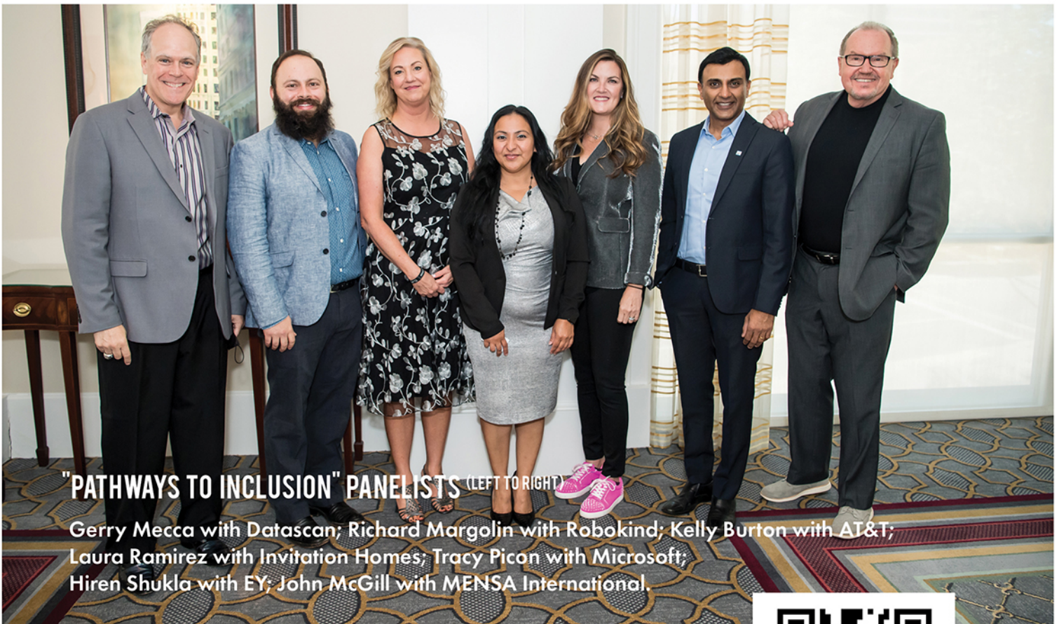
"PATHWAYS TO INCLUSION" PANELISTS (LEFT TO RIGHT)